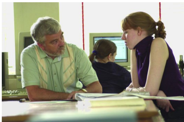
Photo Teaching with FLAP and Hyperflap .

In 1992, following an initiative by the Institute of Physics in 1989, the project FLAP (Flexible Learning Approach to Physics) began [1]. FLAP was led by the University of Reading and the Open University as a consortium project on behalf of the university sector. Over 5 years it received £780K of funding from the UK Higher Education Funding Councils. It produced a high quality supported self-study resource covering first year and foundation year physics and its associated mathematics. This generous support allowed the production of extensive new text materials, designed for the purpose and unlike any pre-existing textbooks in physics or mathematics. It was described by some as a “breath of fresh air”. It allowed physics departments to create courses to their own design and specification in response to a diversifying and changing intake. Key features were its linking of physics and mathematics and its flexibility. It was first delivered in 1995.