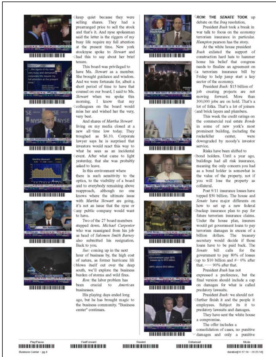
Figure 1. Example Video Paper document.